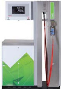
BMP 4000.OE EURO/CNG