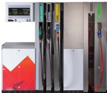
BMP 4000.OE EURO COMBI/CNG